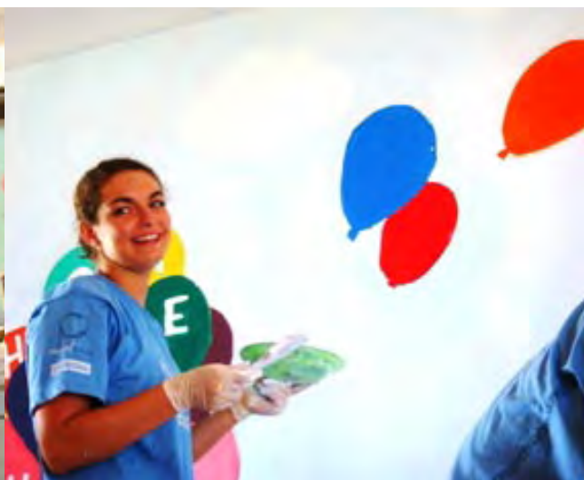
Two week special volunteer was painting