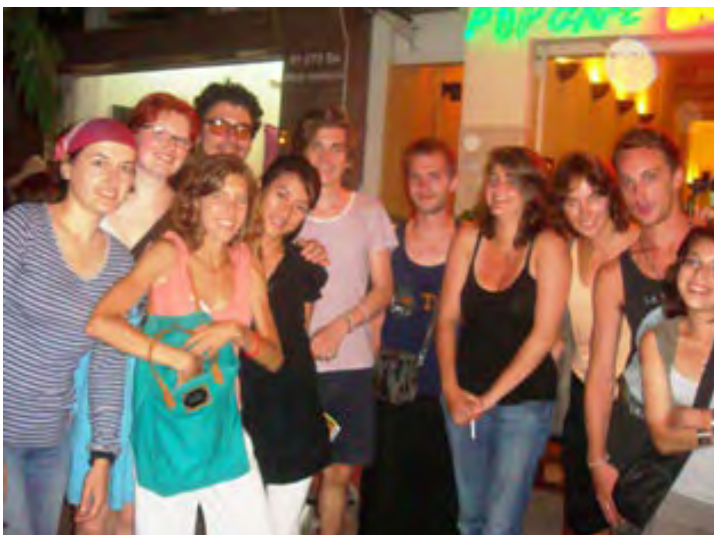
A group of volunteers and staff hang out for dinner for some volunteers' last day in Cambodia. I miss you all.