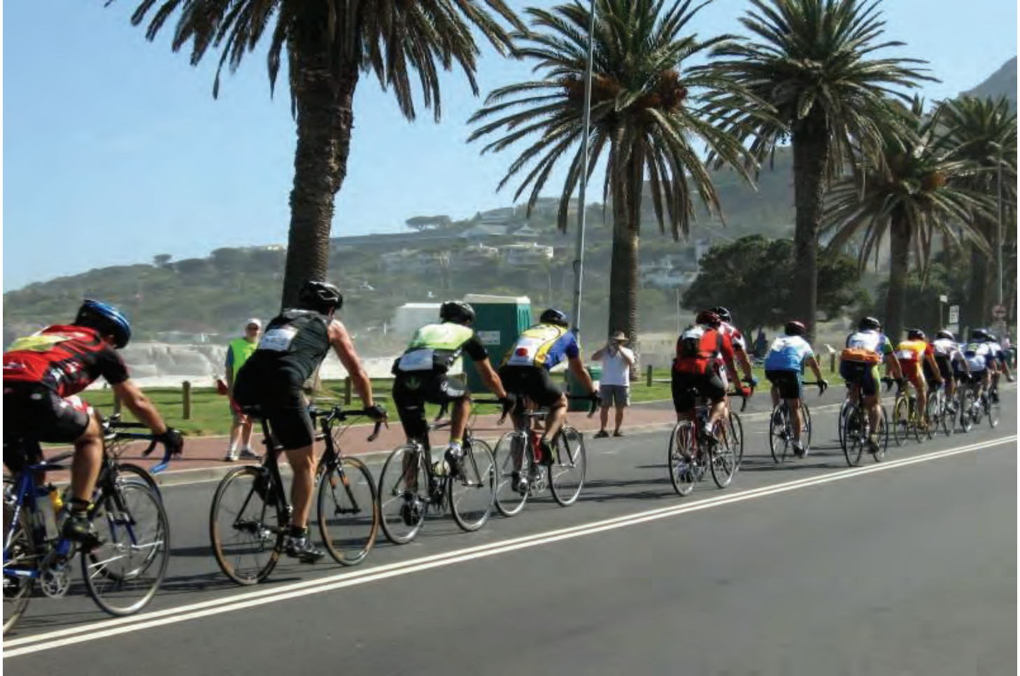
Photo of Cape Argus Race, view from Camps Bay, Cape Town, South Africa (continued PAGE 2)

The world famous Cape Argus Cycle Race, Page 2